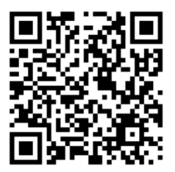
Scan this code to get the Vanco App on your mobile device