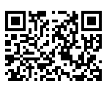
Scan this code to get the Vanco App on your mobile device

Online Giving Option: We share with you the new e-giving platform, Vanco. This platform provides a secure and user-friendly way to give to our church online, and we are confident that it will make giving more convenient for many members of our congregation. You can give now at this website link: https://secure.myvanco.com/L-ZAB8 Whether you choose to give online or in person, your support is vital to the continued success of our church community. We are so grateful for your generosity and