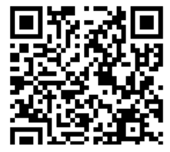
Scan this code to get the Vanco App on your mobile device

Online Giving Option: We share with you the new e-giving platform, Vanco. This platform provides a secure and user-friendly way to give to our church online, and we are confident that it will make giving more convenient for many members of our congregation. You can give now at this website link: https://secure.myvanco.com/L-ZAB8